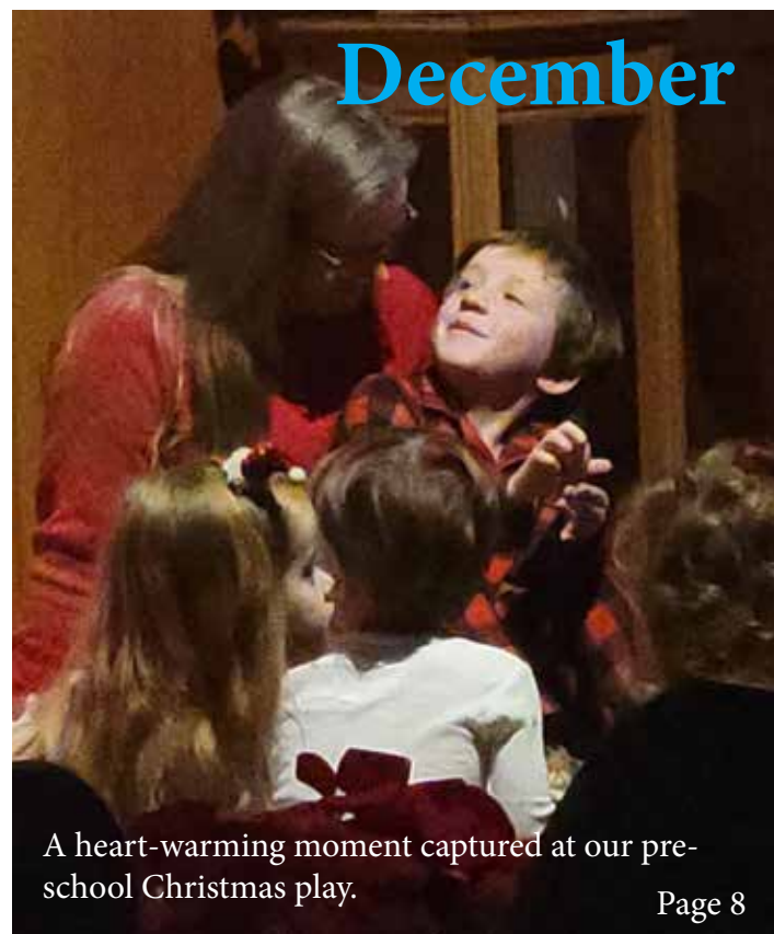
A heart-warming moment captured at our pre-school Christmas play.