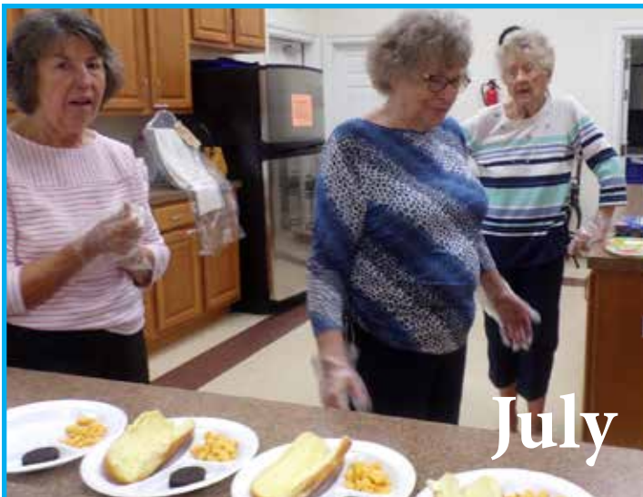
July 1st was the last night of our 2022 VBS.