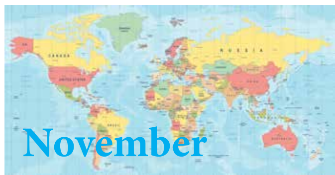
November marked the return home of our second missionary who visited in 2022. It was a blessing having him with us in October and November.