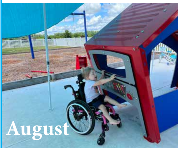
The building of the playhouse was completed in August. This new equipment made our playground accessible to everyone.