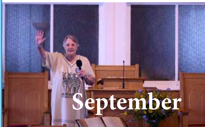
In September, we were blessed by the ministry of our South African missionary.