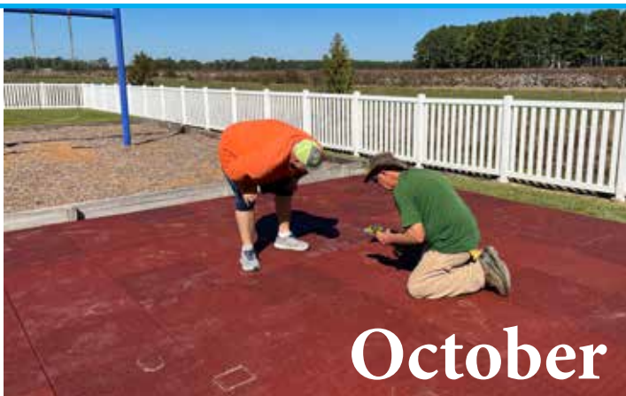
October saw the completion of the rubber flooring for the playhouse that was added in August.